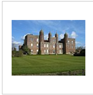
Melford Hall, Suffolk